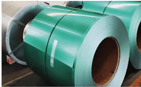
Galvalume coil providing strong and corrosion resistant